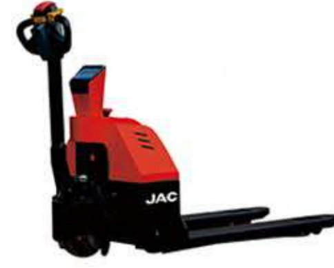
Model: CBD15D Load: capacity: 1500kg Overall fork width: 570/695mm Fork length: 1150mm Max.fork lifting height: 200mm Battery voltage/capacity: 2x12V/65Ah