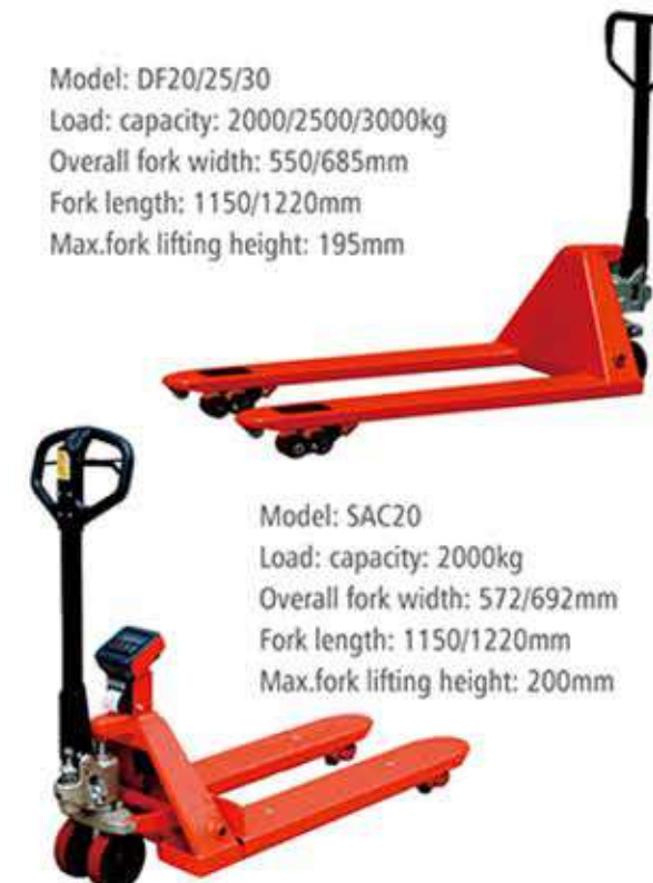
Model: DF20/25/30 Load: capacity: 2000/2500/3000kg Overall fork width: 550/685mm Fork length: 1150/1220mm Max.fork lifting height: 195mm