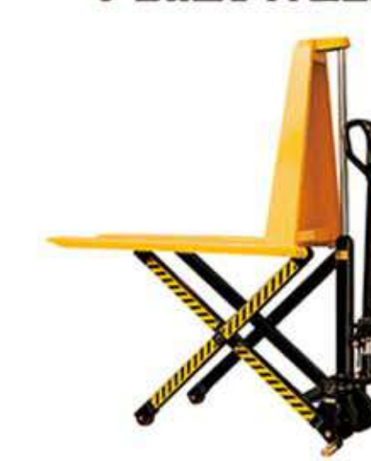
Model: HLT10/15 Load: capacity: 1000-1500kg Overall fork width: 520/680mm Fork length: 1100mm Max.fork lifting height: 800mm