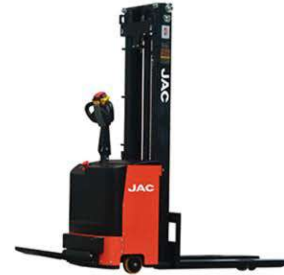
Model: CDD10-I / CDD12-I / CDD15-I Load: capacity: 1000kg / 1200kg / 1500kg Standard lift height: 1600-4000mm Overall fork width: 570/695mm Fork length: 1150mm Battery voltage/capacity: 24V/210Ah