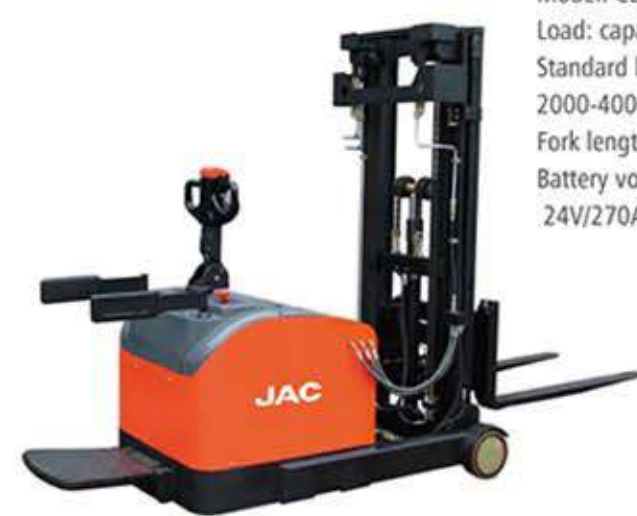
Model: CDD12-II / CDD15-II Load: capacity: 1200kg / 1500kg Standard lift height: 2000-4000mm Fork length: 1070mm Battery voltage/capacity: 24V/270Ah