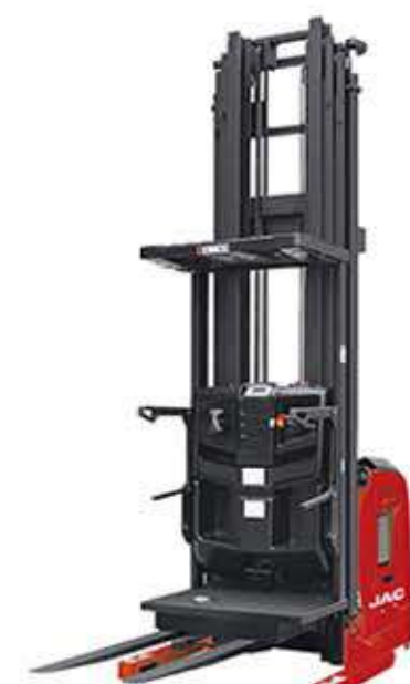
Model: OP515-III Load: capacity: 1500kg Standard lift height: 5000-9000mm Fork length: 1220mm Battery voltage/capacity: 24V/770Ah