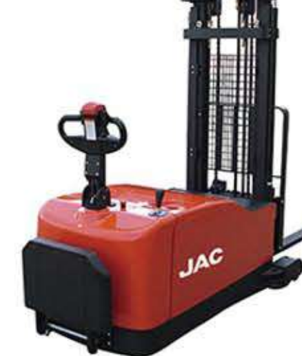
Model: CDD12-II / CDD16-II Load: capacity: 1200kg / 1600kg Standard lift height: 2000-3600mm / 2000-4000mm Fork length: 1070mm Battery voltage/capacity: 24V/270Ah