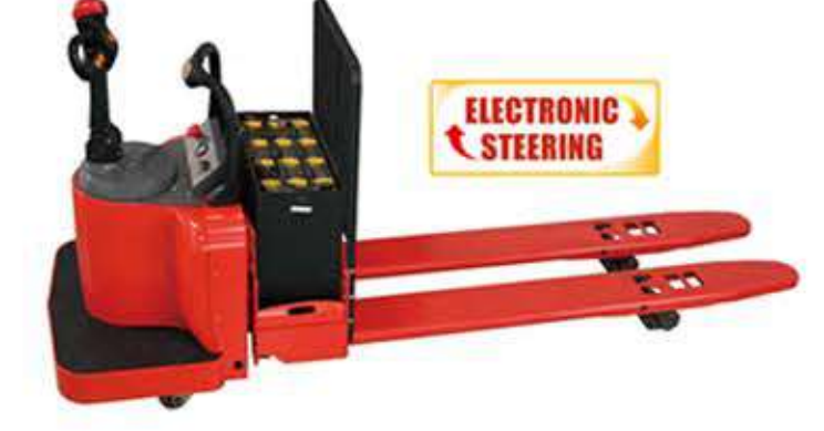
Model: CBD35-II / CBD50-II Load: capacity: 3500kg / 5000kg Overall fork width: 680mm Fork length: 1212mm Max.fork lifting height: 230mm Battery voltage/capacity: 24V/360Ah