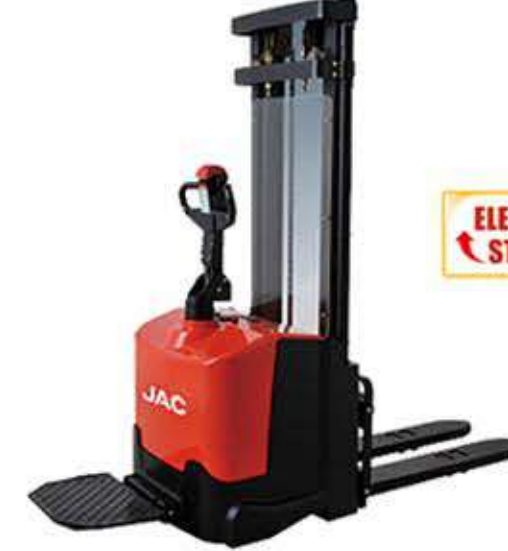
Model: CDD12-II / CDD14-II / CDD16-II / CDD20-II Load: capacity: 1200kg / 1400kg / 1600kg / 2000kg Standard lift height: 2000-4000mm Overall fork width: 550-685mm Fork length: 1150mm Battery voltage/capacity: 24V/280Ah