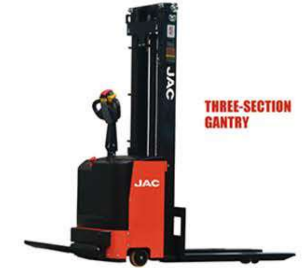
Model: CDD20-I / CDD20-I Three-section gantry Load: capacity: 2000kg / 2000kg Standard lift height: 1600-4000mm / 4000-5000mm Overall fork width: 570/695mm Fork length: 1150mm Battery voltage/capacity: 24V/210Ah / 24V/280Ah