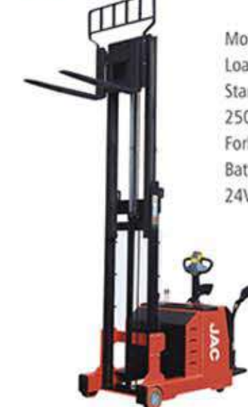
Model: CDD12-I / CDD15-I Load: capacity: 1200kg / 1500kg Standard lift height: 2500-3500mm / 2000-4500mm Fork length: 950mm Battery voltage/capacity: 24V/240Ah / 24V/210Ah