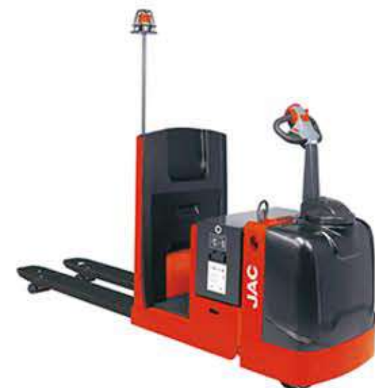
Model: CBD30JX-III Load: capacity: 1300kg Standard lift height: 300mm Fork length: 1220mm Battery voltage/capacity: 24V/560Ah