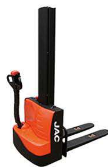
Model: CDD10-II Load: capacity: 1000kg Standard lift height: 1600mm Overall fork width: 550/685mm Fork length: 1150/1200mm Battery voltage/capacity: 2x12V/70Ah