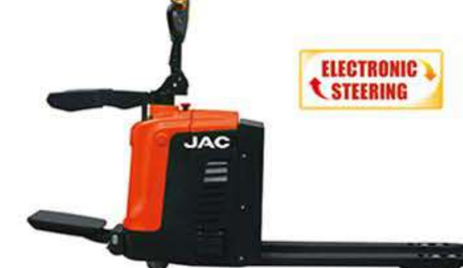
Model: CBD20-1 / CBD25-1 / CBD30-1 Load: capacity: 2000kg / 2500kg / 3000kg Overall fork width: 540/685mm Fork length: 1150/1220mm Max.fork lifting height: 200mm Battery voltage/capacity: 24V/210Ah