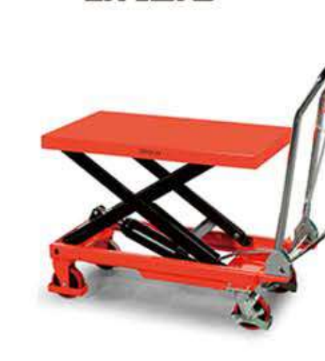
Model: TF15/30/50/75 Load: capacity: 150/300/500/750kg Max.fork lifting height: 720/880/900mm