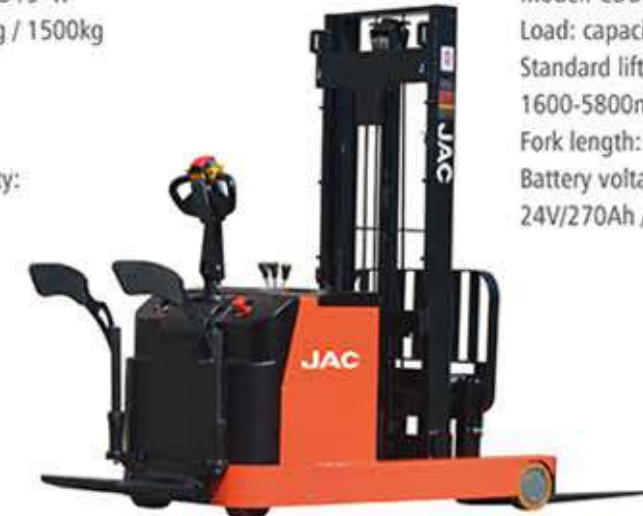
Model: CDD15-I / CDD20-I Load: capacity: 1500kg / 2000kg Standard lift height: 1600-5800mm / 2500-3000mm Fork length: 950mm / 1070mm Battery voltage/capacity: 24V/270Ah / 24V/280Ah