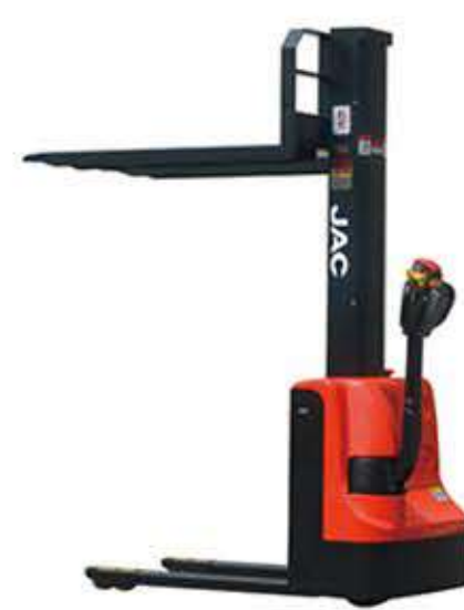
Model: CDD10-I Load: capacity: 1000kg Standard lift height: 1600mm Overall fork width: 570/695mm Fork length: 1150mm Battery voltage/capacity: 2x12V/100Ah