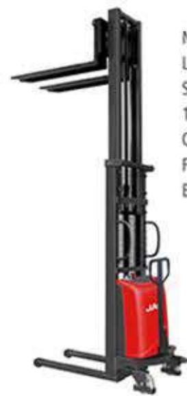
Model: CDD10-I / CDD15-I / CDD20-I Load: capacity: 1000kg / 1500kg / 2000kg Standard lift height: 1600-3500mm / 1600-3500mm / 1600-3000mm Overall fork width: 550/640mm Fork length: 900/1100mm Battery voltage/capacity: 12V/120Ah