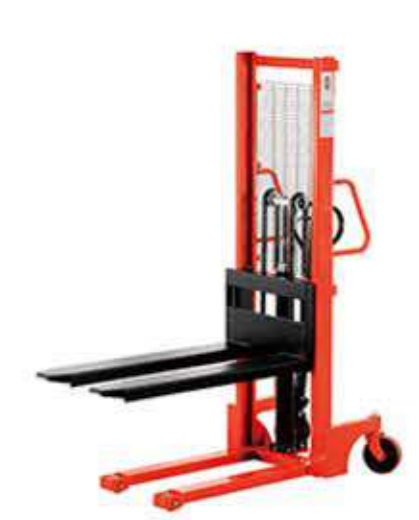
Model: SFH10/15 Load: capacity: 1000/1500kg Standard lift height: 1600-2500mm Overall fork width: 1300-740/550mm Fork length: 900/1150mm