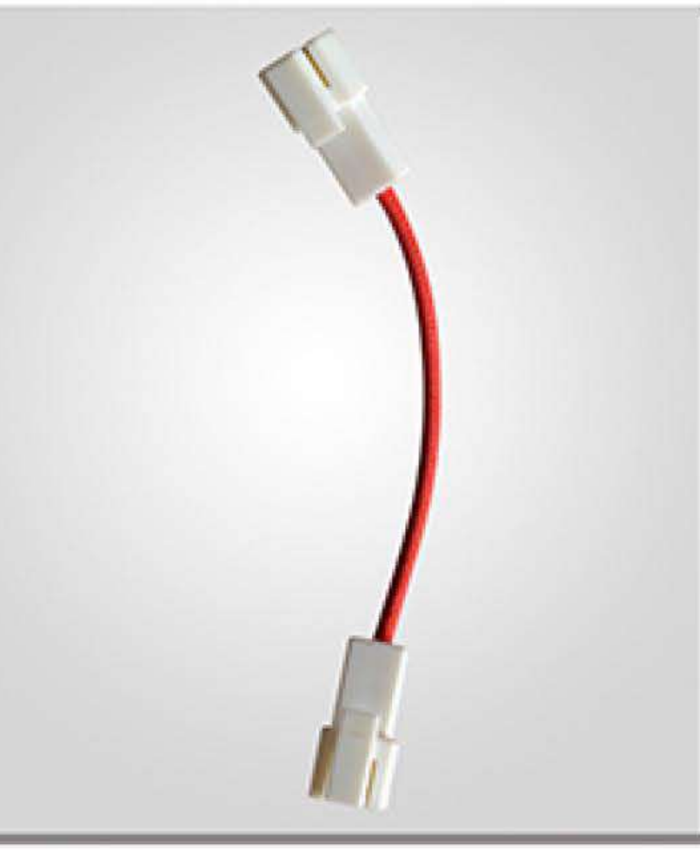
Fusible link wire