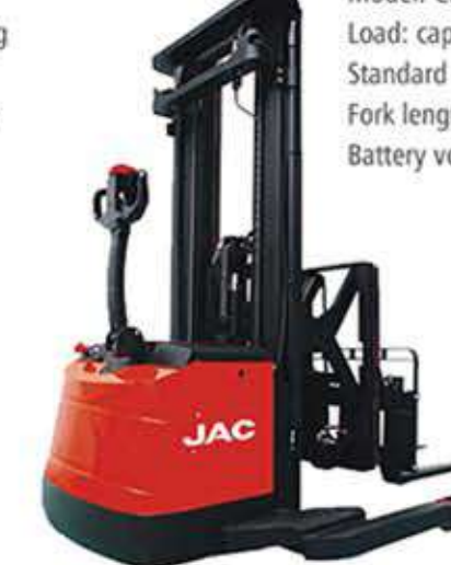
Model: CDD12-II / CDD14-II Load: capacity: 1300kg / 1400kg Standard lift height: 3800-5500mm Fork length: 1070mm Battery voltage/capacity: 24V/345Ah