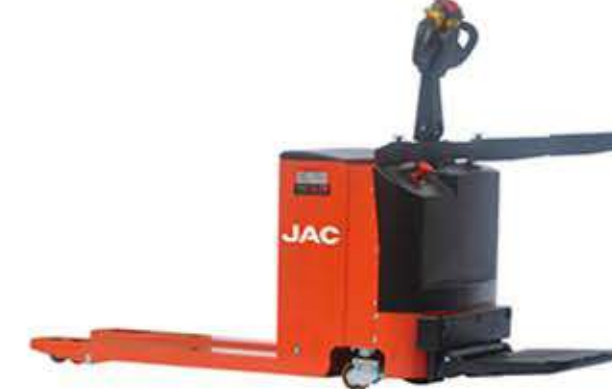
Model: CBD20-1 Load: capacity: 2000kg Overall fork width: 540/685mm Fork length: 1150/1220mm Max.fork lifting height: 200mm Battery voltage/capacity: 2x12V/100Ah