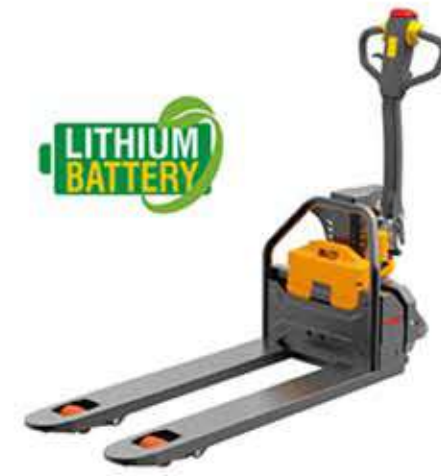
Model: CBD12-III Load: capacity: 1200kg Overall fork width: 550/680mm Fork length: 1150mm Max.fork lifting height: 200mm Battery voltage/capacity: 48V/20Ah