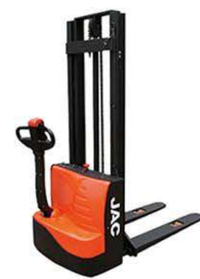
Model: CDD10-II Load: capacity: 1000kg Standard lift height: 2000-3300mm Overall fork width: 550/685mm Fork length: 1150mm Battery voltage/capacity: 2x12V/70Ah