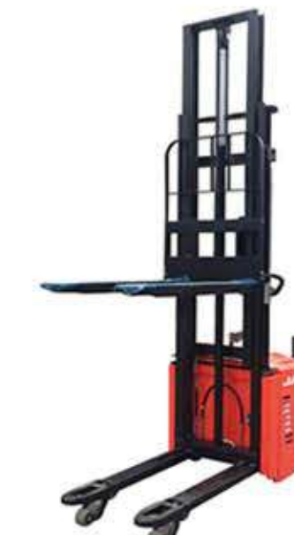
Model: CDD15-I / CDD20-I Load: capacity: 1500kg / 2000kg Standard lift height: 2600-3600mm Overall fork width: 570/685mm Fork length: 1150mm Battery voltage/capacity: 24V/210Ah