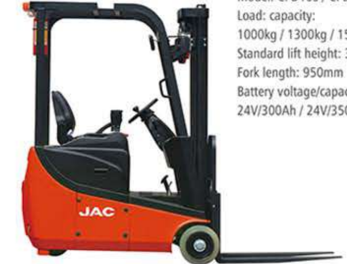
Model: CPD10S / CPD13S / CPD15S Load: capacity: 1000kg / 1300kg / 1500kg Standard lift height: 3000-4500mm Fork length: 950mm Battery voltage/capacity: 24V/300Ah / 24V/350Ah / 24V/400Ah