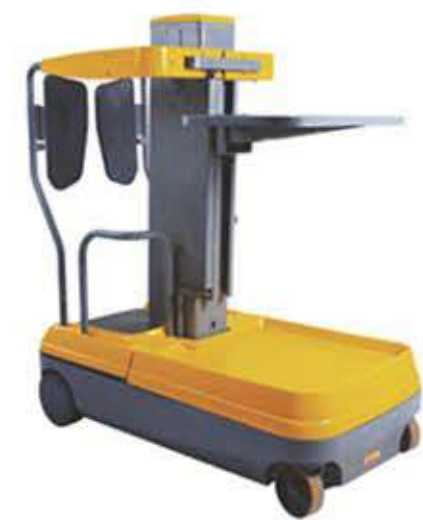
Model: OP5-JXM Load: capacity: 90-150kg Platform height max: 3000mm Working height max: 5000mm Battery voltage/capacity: 24V/200Ah