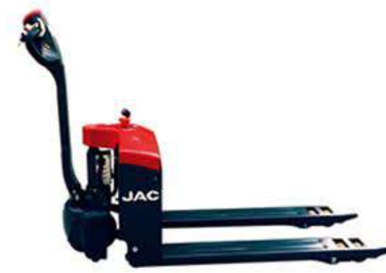
Model: CBD15-1 / CBD15-II Load: capacity: 1500kg Overall fork width: 560/685mm / 550/685mm Fork length: 1150mm Max.fork lifting height: 200mm Battery voltage/capacity: 2x12V/65Ah / 2x12V/70Ah