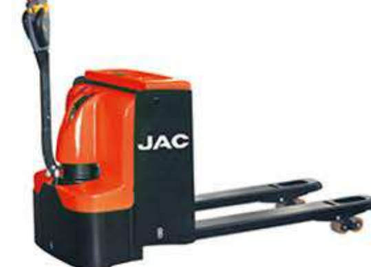
Model: CBD20-1 Load: capacity: 2000kg Overall fork width: 550/685mm Fork length: 1150mm Max.fork lifting height: 200mm Battery voltage/capacity: 24V/210Ah