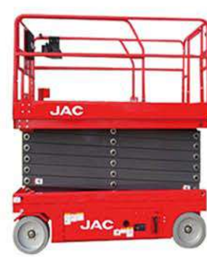
Model: SJPT Load: capacity: 230-450kg Platform height max: 5.8-11.8m Working height max: 7.8-13.8m Battery voltage/capacity: 24V/200Ah