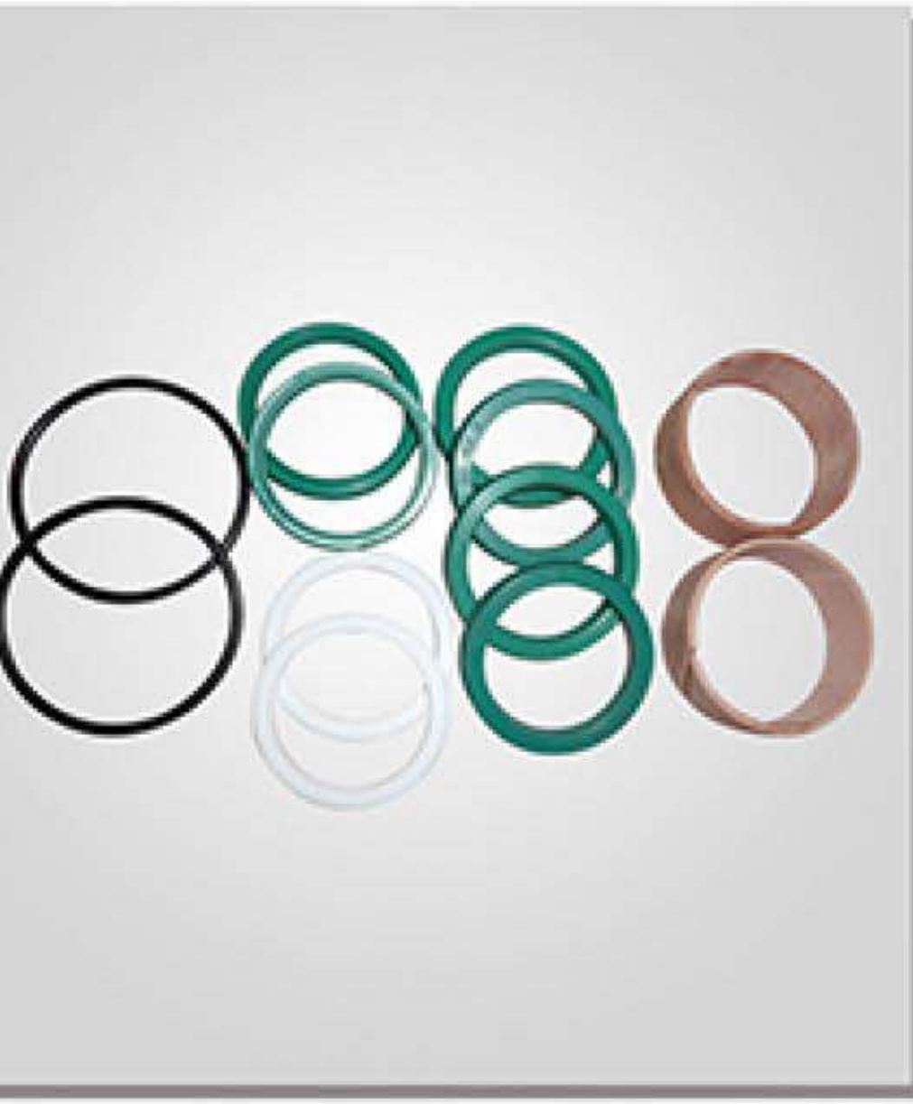
Cylinder repair kits