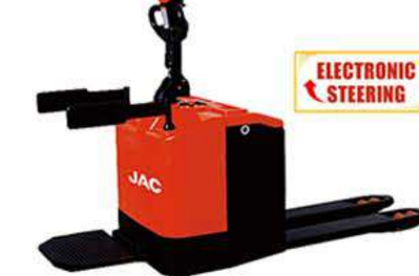
Model: CBD20-II / CBD25-II / CBD30-II Load: capacity: 2000kg / 2500kg / 3000kg Overall fork width: 550/685mm Fork length: 1150/1200mm Max.fork lifting height: 205mm Battery voltage/capacity: 24V/210Ah / 24V/270Ah / 24V/270Ah