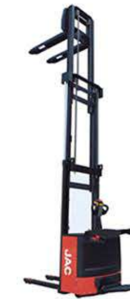
Model: CDD15-I Load: capacity: 1500kg Standard lift height: 4000-5500mm / 4000-6000mm Overall fork width: 570/695mm Fork length: 1150mm Battery voltage/capacity: 24V/280Ah / 24V/240Ah