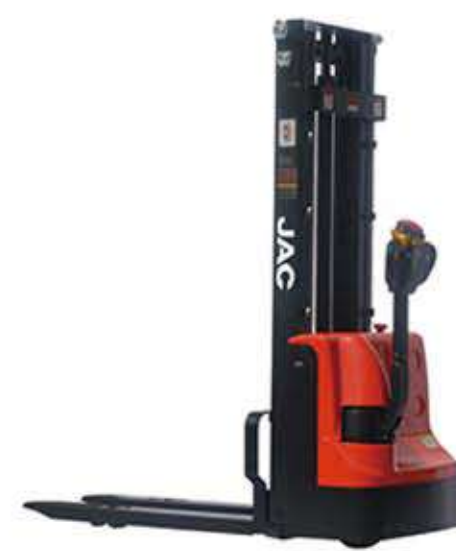
Model: CDD10-I / CDD15-I Load: capacity: 1000kg / 1500kg Standard lift height: 1600-3500mm / 1600-3500mm Overall fork width: 570/695mm Fork length: 1150mm Battery voltage/capacity: 2x12V/100Ah